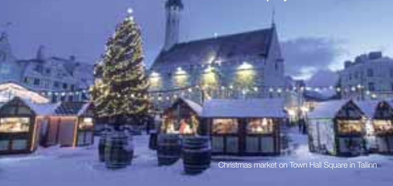
Christmas market on Town Hall Square in Tallinn

www.tallinn-life.com • www.swissotel.com • www.partyintallinn.com