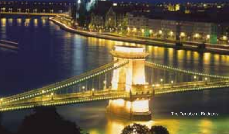
The Danube at Budapest

www.budapest-life.com • www.museum.hu • www.budapest.travel