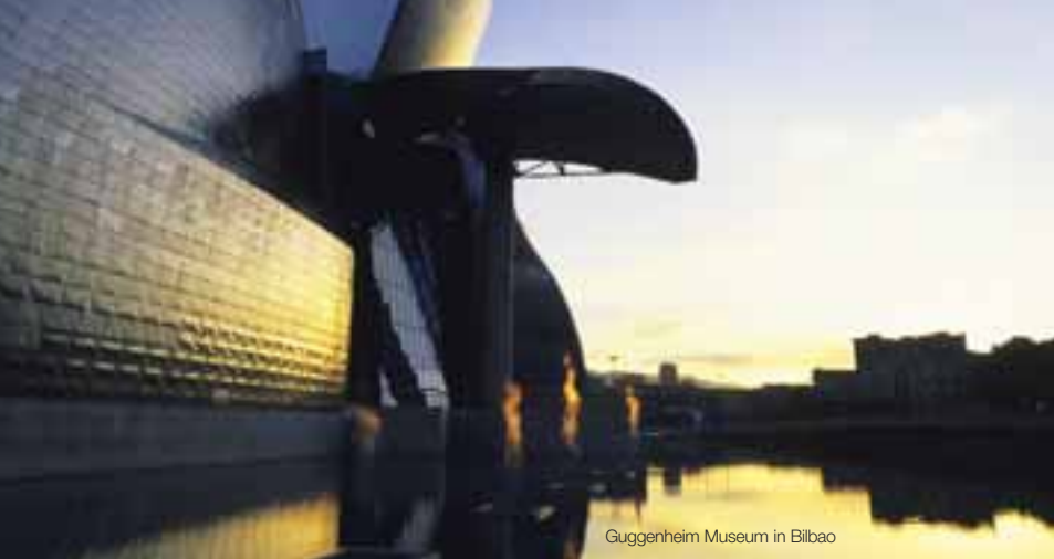
Guggenheim Museum in Bilbao