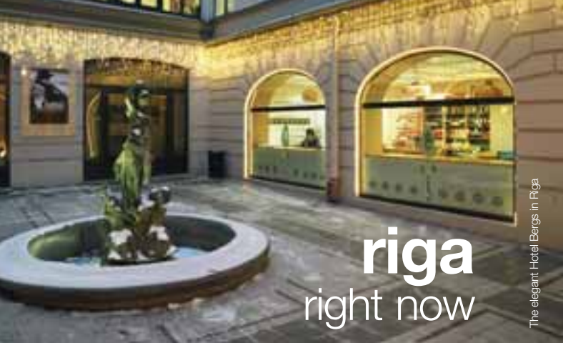
The elegant Hotel Bergs in Riga