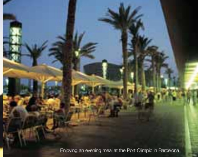
Enjoying an evening meal at the Port Olímpic in Barcelona