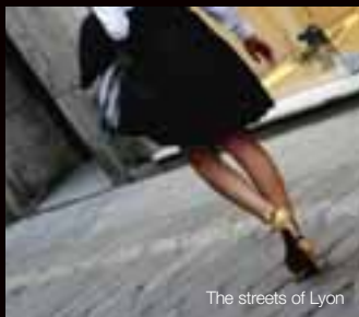
The streets of Lyon

Look beyond the glittering lights and unabashed romance of Paris to reveal three very different faces of France.