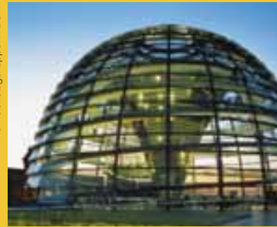
The Reichstagskuppel in Berlin

The city's cultural scene effortlessly blends traditional and modern. The Elbe Valley, a World Heritage site, boasts lush meadows, magnificent villas and majestic palaces. Turn any corner in the old town of Dresden and your breath is taken away by a stunning building or cathedral. The recently restored Frauenkirche, Church of Our Lady, is a highlight. Theaterplatz Square is graced by