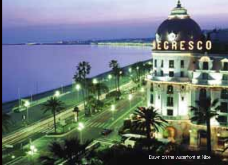
Dawn on the waterfront at Nice

Many visitors will feel they have seen Marseille before they even