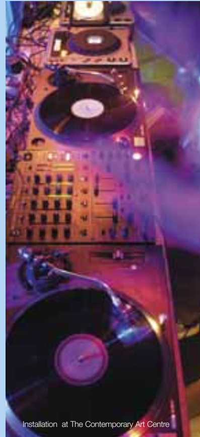
Installation at The Contemporary Art Centre

The Contemporary Art Centre showcases a changing roster of local and international art stars: expect to see a video installation by a New York DJ one week, and original works by an up-and-coming Lithuanian sculptor the next. From there, swing by the Jonas Mekas Visual Arts Center. Named after the Lithuanian-American filmmaker icon, it opened 18 months ago as a celebration of avant-garde creativity. A host of smaller private galleries around the city also celebrate Lithuania's rich artistic history.