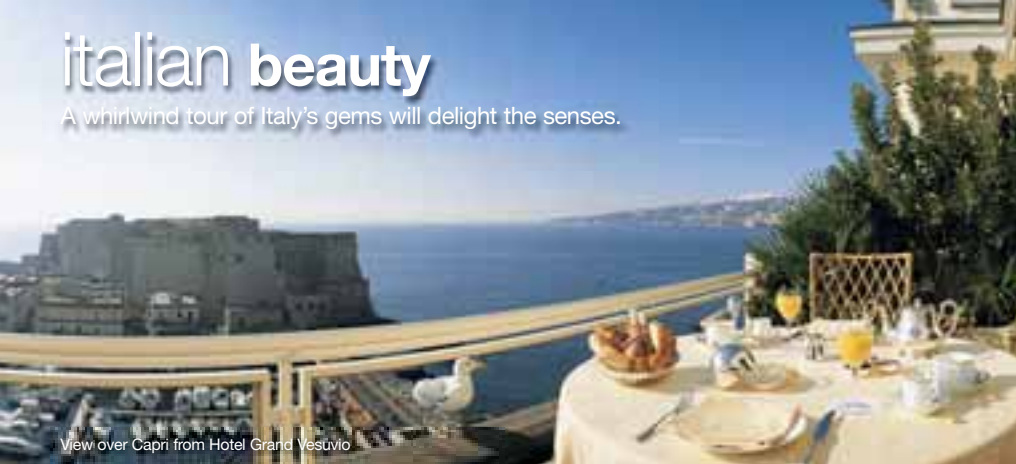
View over Capri from Hotel Grand Vesuvio

A whirlwind tour of Italy's gems will delight the senses.