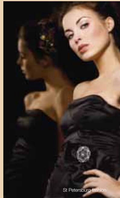
St Petersburg fashion